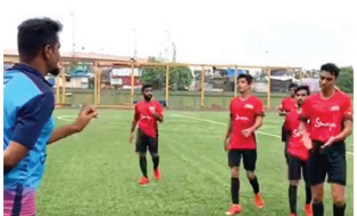
Coaching and Training in Sports Management