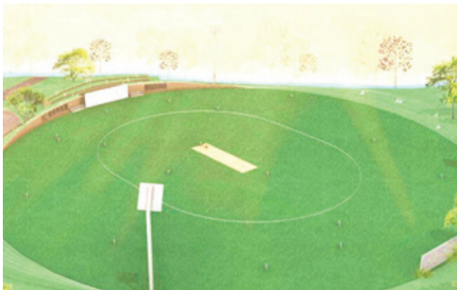
Sports Facilities Planning and Management