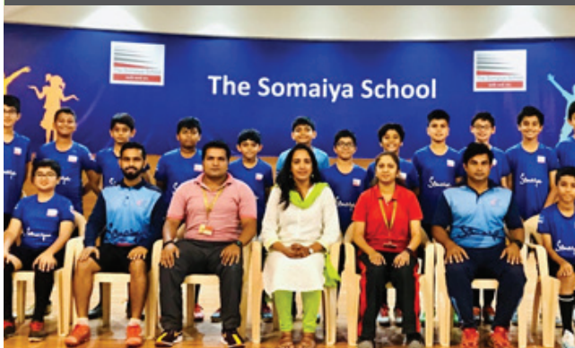
Grassroots Sports Development