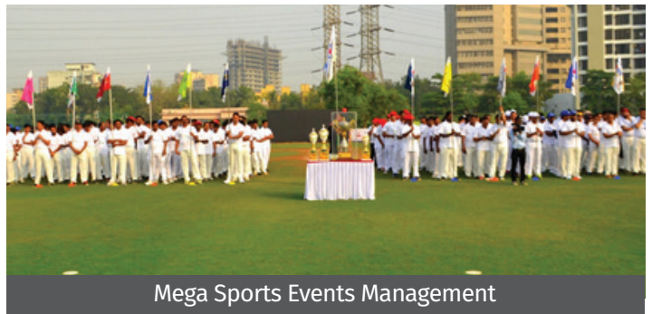
Mega Sports Events Management