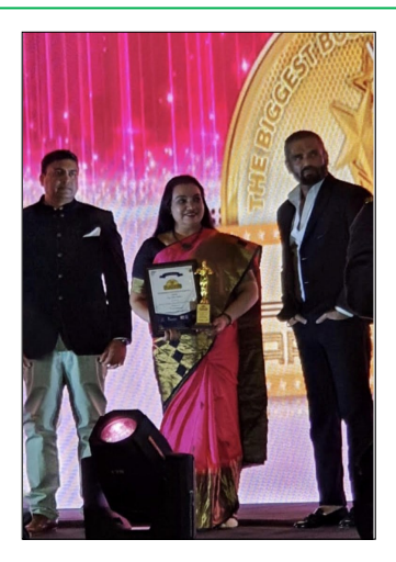
Click here to read more