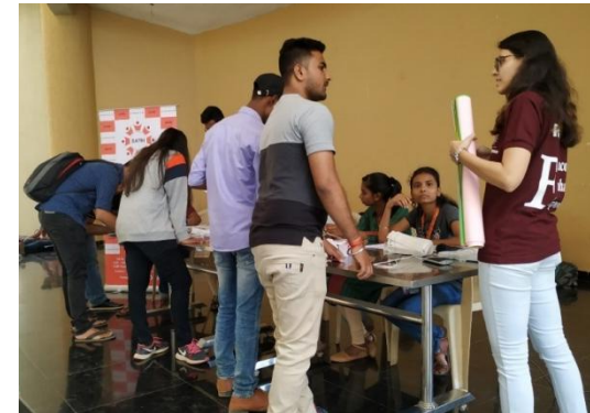
Stem Cell Donation