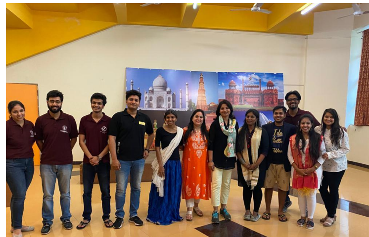
EkQuality- Equality Through Art