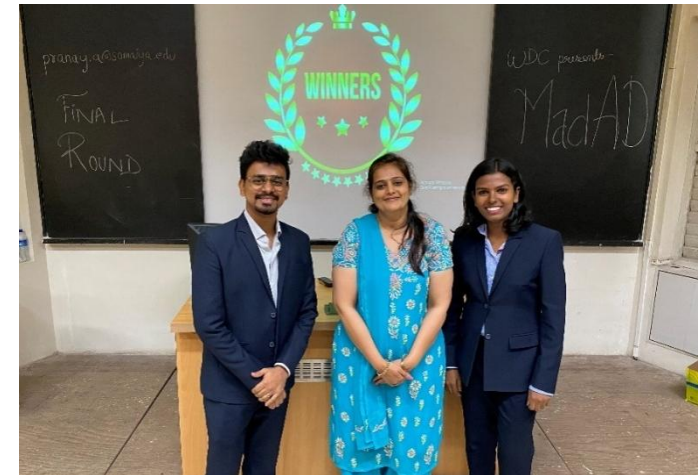
MAD AD Competition